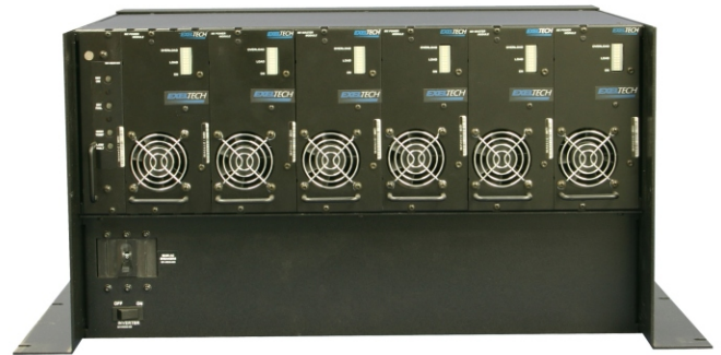
Front View without Front Cover